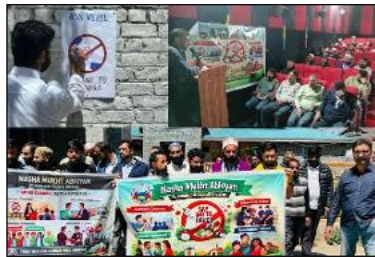
engaged youth in spreading the message of a drug free society. Meanwhile, at GDC Shopian, NSS units organized a dedicated

SHOPIAN, APRIL 22: In continuation of the ongoing Nasha Mukht Jammu & Kashmir Abhiyan, awareness and wall painting activities were extensively conducted across various schools in District Shopian. Students actively participated in painting walls and creating impactful visuals carrying strong anti-drug messages such as "Say No to Drugs" and "Choose Life, Not Drugs". The initiative provided a creative platform for students to express their views on the harmful effects of drug abuse while reinforcing awareness through art. The activities witnessed enthusiastic participation and effectively