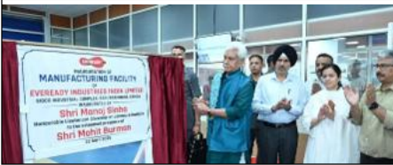
Lieutenant Governor Manoj Sinha inaugurating the Eveready Industries India Limited plant in Samba.

His vision has turned the dream of a prosperous Jammu Kashmir into reality," the Lieutenant Governor observed that across the territory, the Government is committed to ensuring that the economic growth is inclusive and sustainable. He highlighted the role of the private sector in job creation and economic development. The plant is expected to create thousands of jobs and boost the local economy. The LG also mentioned the government's efforts to improve infrastructure and provide incentives to investors. He concluded by saying that the inauguration of this plant is a significant step towards the economic development of the state.