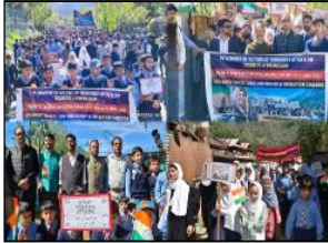
strong message against violence and extremism, reflecting the collective resolve of the younger generation to stand for peace, democracy, and harmony. Participants emphasized the importance of unity and resilience in the face of adversity, highlighting that acts of terror cannot shake the spirit of the people. Speakers at the events noted that such initiatives are a testament to the growing awareness and responsibility among youth, who are determined to contribute towards a peaceful, progressive, and prosperous Jammu & Kashmir.

KUPWARA, APRIL 22: Over 2,000 students from across Karnah Sub Division participated in solidarity marches to honour the victims of the Pahalgam terror attack, while also marking the anniversary of Operation Sindoor. Students representing both government and private educational institutions gathered in large numbers and marched at AGS Hajinar, GDC Kandri, and AGS Tithwal. The rallies witnessed enthusiastic participation, with students raising their voices against terrorism and expressing unwavering support for the nation, the Indian Armed Forces, and the families affected by the tragic incident. The marches served as a