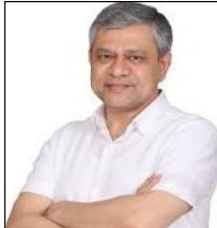
SHRI ASHWINI VAISHNAV

More than 25,000 trains run across India every day. They carry more than 20 million passengers daily and move large quantities of coal, iron ore, grains, steel, cement and other commodities across a network of over 1,37,000 kilometres tracks.